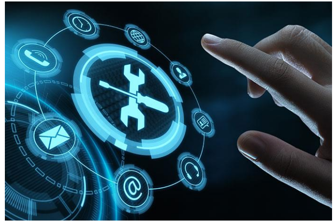
IN Services PMI - points